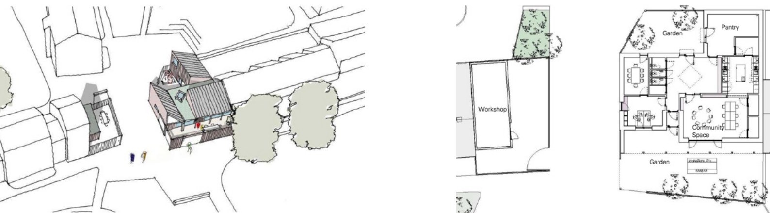
Concept designs of the original Greenway Neighbourhood Hub

In 2022-23 Wester Hailes Growing Communities commissioned Community Enterprise and Calum Duncan Architects to develop a business plan and design for a “Greenway Hub”, community centre which would be sited in a large slatted area to the North of the Greenway Garden. WHGC is in the process of buying the site from the Council through community asset transfer. We hope to finally own the site by Spring 2025.